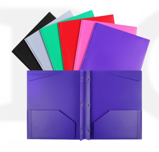
Plastic Pocket foler with Brads