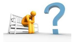
Responsible Decision Making