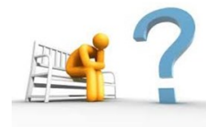
Responsible Decision Making