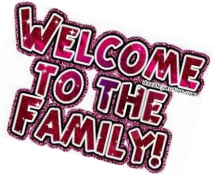
Mr Javier Napoles

Shout out to the following Vista Vipers Educator!!