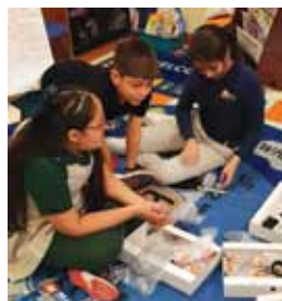
Vista LEGO EV3 Tracker